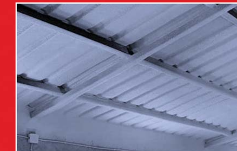
DECK SHEET PANEL INSULATION