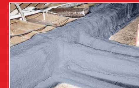
HVAC SYSTEM INSULATION